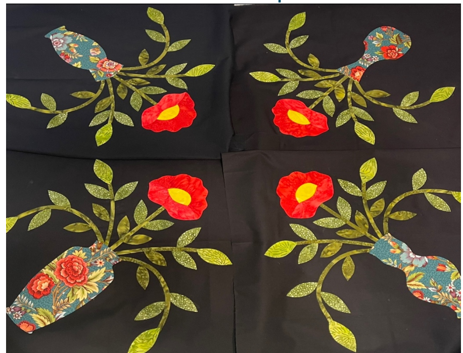
Example of how you can lay out your four chosen vases. You'll get 12 vase patterns to make a whole quilt if you like! Page 2