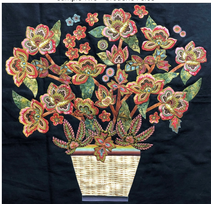
Sample Three – Broderie Perse Page 2