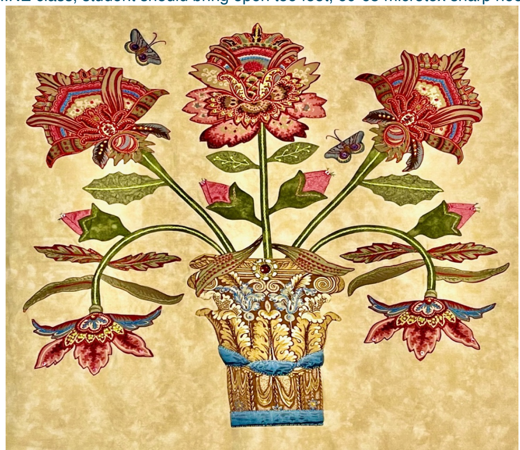
Original background shown – Belle of the South

MOST EVERYTHING needed to make the wall-hanging! All fabric, including background choice, pattern, thread, most notions needed, beads, embroidery floss. Student needs to bring small scissors, straight pins and any preferred supplies and light. If MACHINE class, student should bring open toe foot, 60-65 microtex sharp needle.