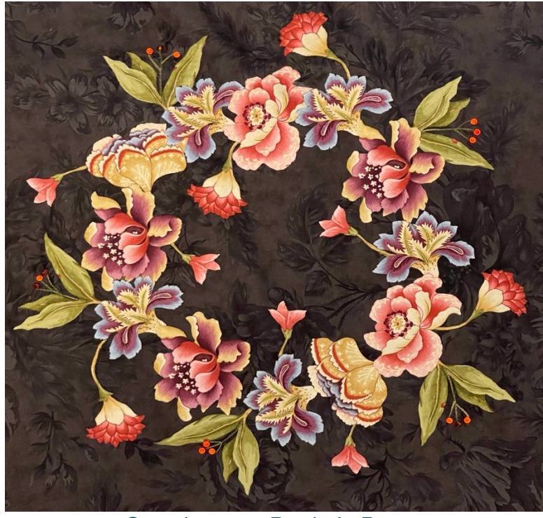
Sample one - Broderie Perse

*Students will begin sewing right away on a provided sample, then delve right into making applique pieces and sewing them.