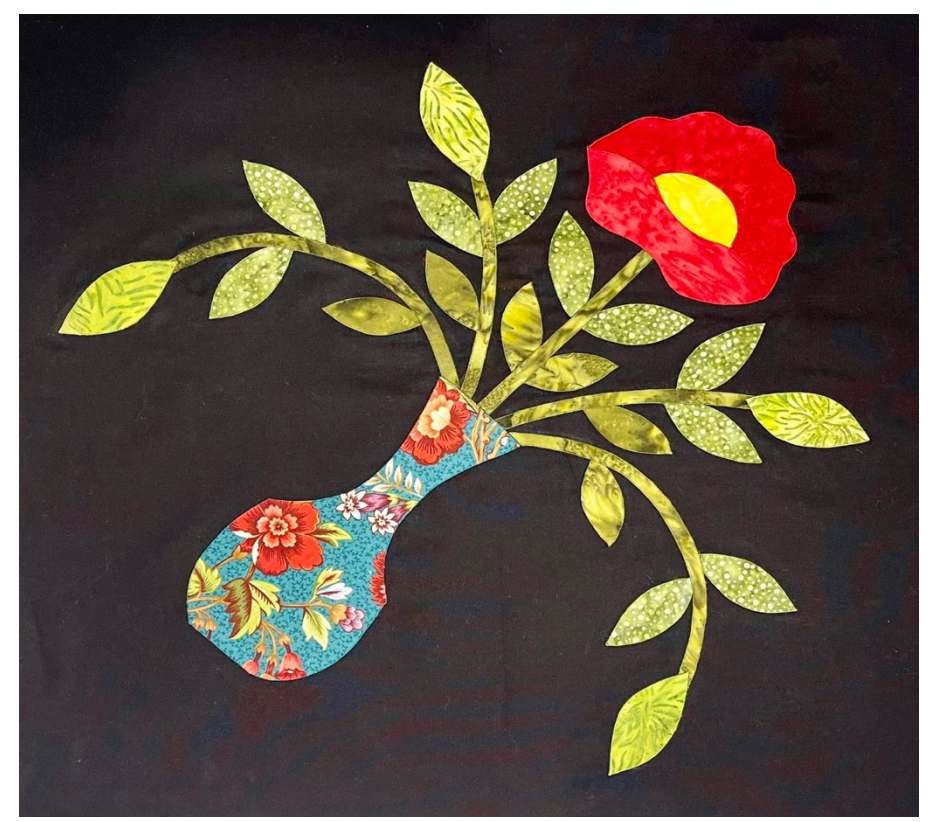
One of Twelve vase patterns