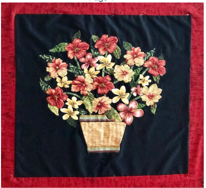
Sample Two – Broderie Perse