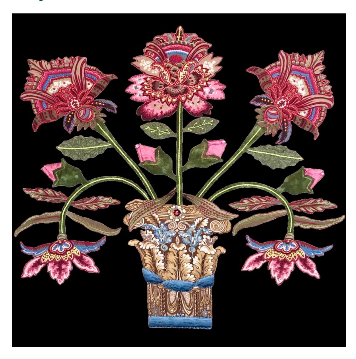
Background shaded to black to show different choice – Belle of the South